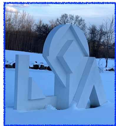
Family of Form, painted wood and chrome vinyl, 32" x 12" x 88", 2025