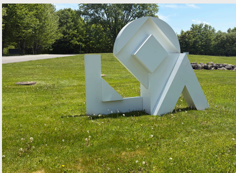
Family of Form , painted wood and chrome vinyl, 32" x 12" x 88", 2025