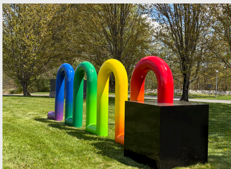
Out of the Box , painted wood and chrome vinyl, 70" x 45" x 285", 2026