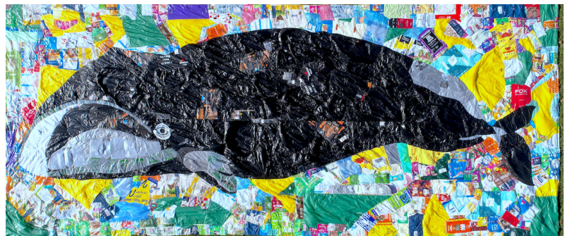
Bowhead Whale Balaena mysticetus